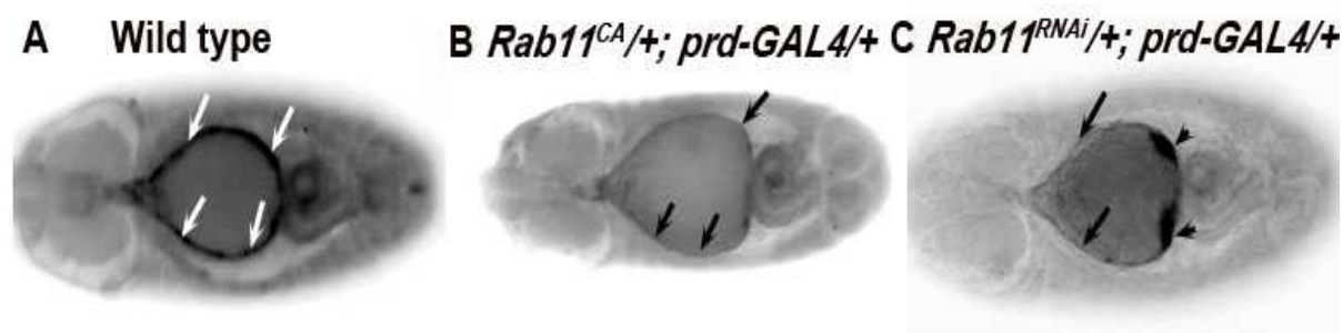
Fig 2. Immunostaining of stage 14 wild type (A), Rab11 CA (B) and Rab11 RNAi (C) embryos using anti- \beta PS-antibody. Anterior is on the left side in all the images. The arrows in B and C indicate the areas where there is a loss of \beta PS-integrins from the leading edge epidermal cells as compared with wild type. The arrowheads in C indicate the areas where there is an aggregation of \beta PS-integrins.