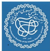
Biochemical Society of the Islamic Republic of Iran