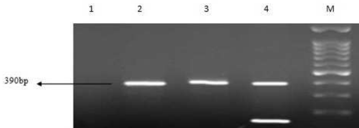
Fig. 1. Multiplex PCR amplification fragments for the detection of vim and imp gene among Acinetobacter baumannii isolates. Lane 1: negative control, lanes 2, 3: positive vim strains, lane 4: positive control of vim and imp genes and M: 1kb DNA size marker

According to many studies, A. baumannii is known as one of the most common Gram negative bacteria that can cause nosocomial infection in health care centers especially in burned hospitalized patients (2, 3, 8). Treatment of infection due to XDR A. baumannii is extremely difficult and causes more morbidity and motility in hospitalized burn