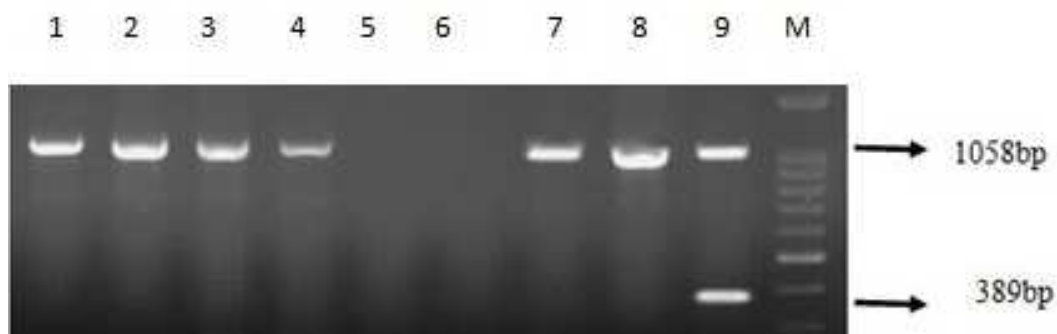
Fig. 3. PCR amplification fragments for the detection of oxa-23 and oxa-48 genes among Acinetobacter baumannii isolates. Lane 1- 4 and 7, 8: positive oxa-23 strains, lanes 5, 6: negative control of oxa-23 and oxa-48 genes, lane 9: positive control of oxa-23 and oxa-48 genes and M: 1kb DNA size marker