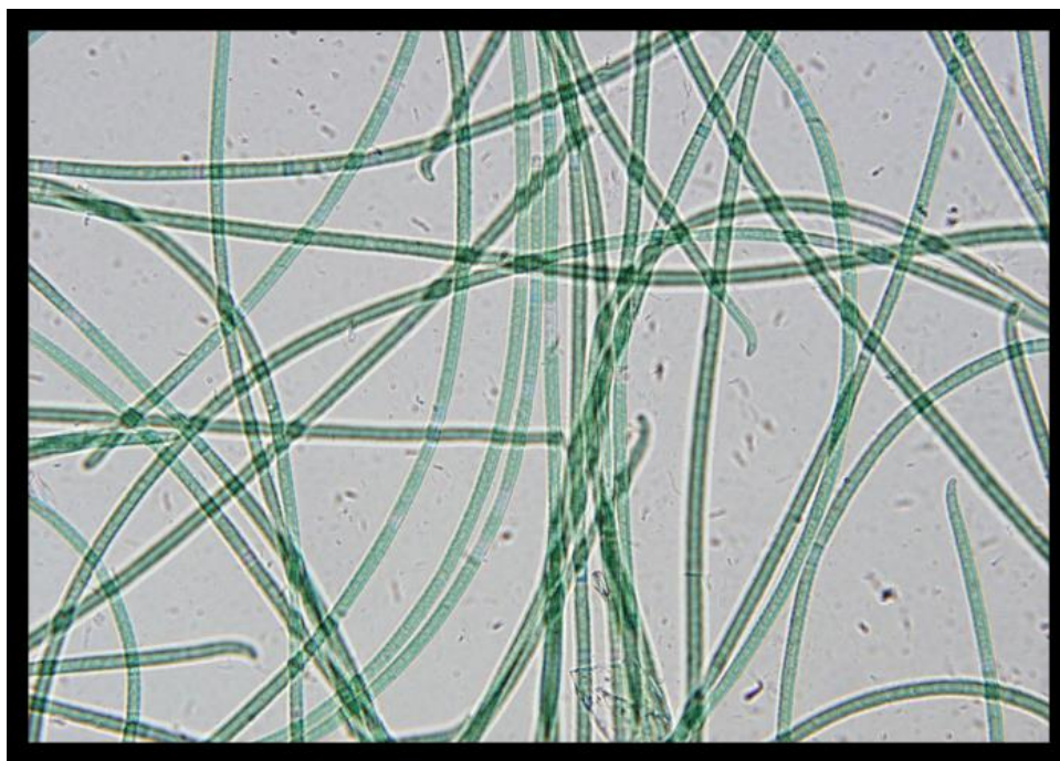
Fig.1. Morphology of isolated micro algal culture P. retzii .

The selected pure microalgal culture was identified and authenticated (Ref no: BSI/SRC/ 5/23/ 2017/ Tech/54) as P. retzii (Figure 1). P. retzii is the unbranched filamentous blue green algae with prominent granules spread throughout in cell volume. Three grams of dry biomass was obtained when the microalgae grew to 10 litres.