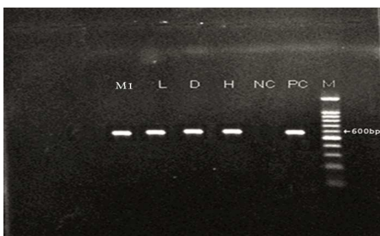
Fig 3. PCR Product from extracted DNA of Sarcocystis in different tissues. M: Molecular weight marker (100bp), PC: Positive Control, NC: Negative Control, H: Heart, D: Diaphragm, L: Liver, M1: Muscle.