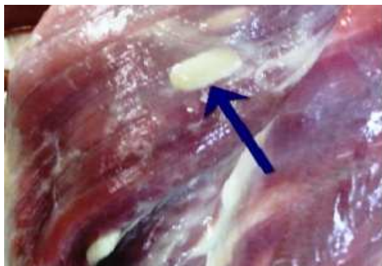
Fig 1. Macroscopic cyst in muscle of sheep.