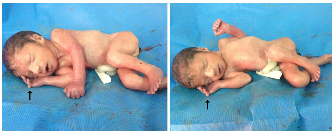
Fig. 2. Photographs of the index patient after abortion. The extra finger on the right hand is highlighted by an arrow..